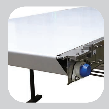
White Polyurethane Food Grade